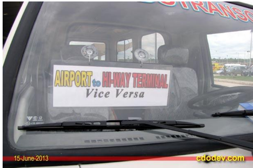
Airport Shuttle by Super 5 – Airport to Highway P50