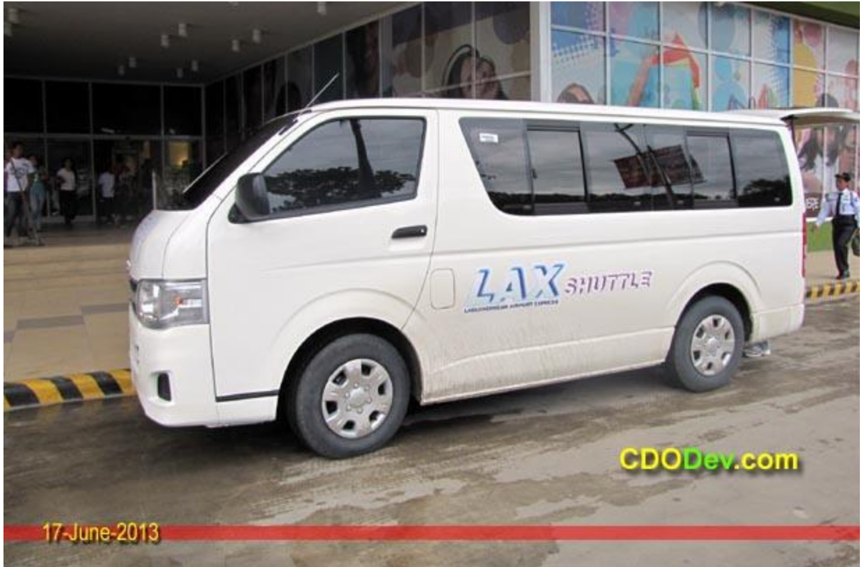
The terminals of both LAX and Magnum Express are just a walking distance from each other as shown below.